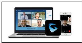
Mobile, Desktop & Web

The UCM6300 series provides a high-end unified communications solution packed with an ecosystem of mobility, security, video and collaboration tools.