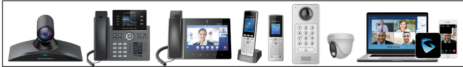
Internal Network Devices